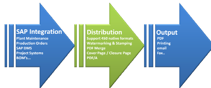
Figure 3: Output and print document structures from plant maintenance orders and other SAP transactions

To ensure the documents are controlled, watermarking and stamping can also be applied.